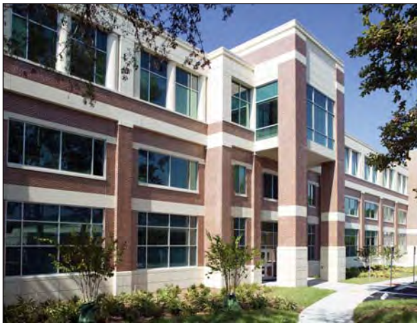
Elkins built the first LEED building in Jacksonville, the UNF Social Sciences building.