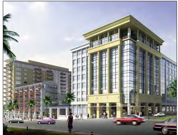
Elkins will obtain LEED Silver certification for its new corporate headquarters in Jacksonville.

Savannah Branch and we have staff who have served as Board members for the USGBC-Northeast Florida Chapter. We have 28 LEED Accredited Professionals on staff at every level of our organization from vice presidents to superintendents. Our involvement means we get the latest in information and technological changes associated with constructing green buildings.